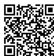
Student Resources Page