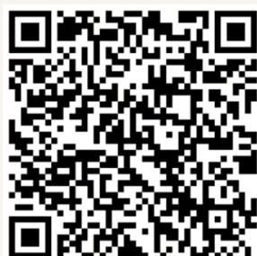
Program QR Code