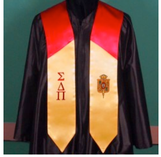
C. $45 - Fancy Gold Stole Only for Sigma Delta Pi Student Chapter Officials Only for Sigma Delta Pi Chapter President