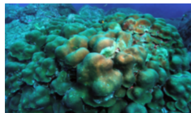
Orbicella annularis Lobed Star Coral