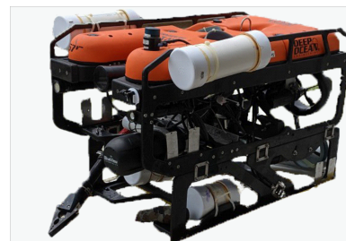
What is an ROV?