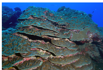
Orbicella franksi Boulder Star Coral