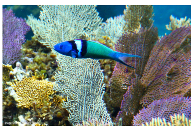
Thalassoma bifasciatum Bluehead Wrasse