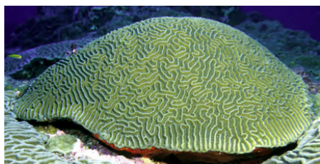
Pseudodiploria strigosa Symmetrical Brain Coral

https://sanctuaries.noaa.gov/vr/flower-garden-banks/barrel-sponge.html