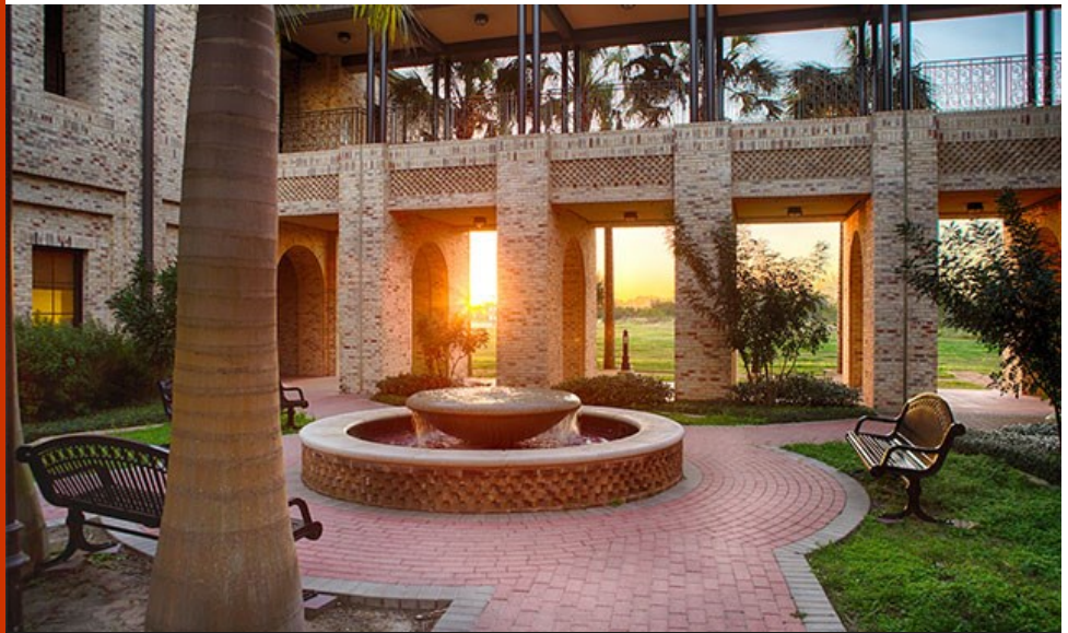
The University of Texas Rio Grande Valley - Brownsville Campus