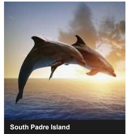
South Padre Island