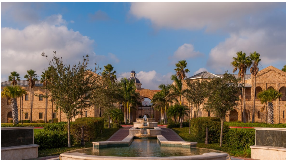
The University of Texas Rio Grande Valley—Brownsville Campus

UTRGV is a member of The University of Texas system. UTS is one of the nation's largest systems of higher education, with 14 institutions that educate more than 216,000 students and is ranked No. 1 in Texas and third in the nation in federal research expenditures.