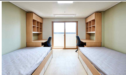
Room (Double Occupancy)