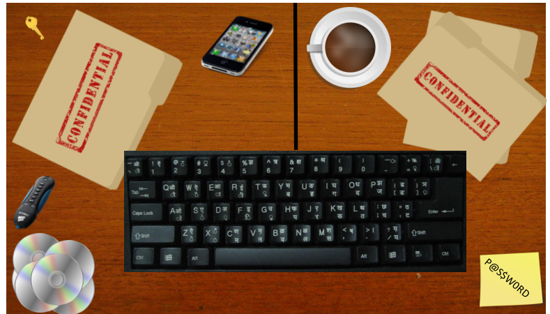
An example of a BAD practice

A clean desk practice ensures that all sensitive/confidential materials are removed from an end user workspace and locked away when the items are not in use or an employee leaves his/her workstation. It is one of the top strategies to utilize when trying to reduce the risk of security breaches in the workplace. Please use the checklist below daily to ensure your work (or home) workspace is safe, secure, and compliant.