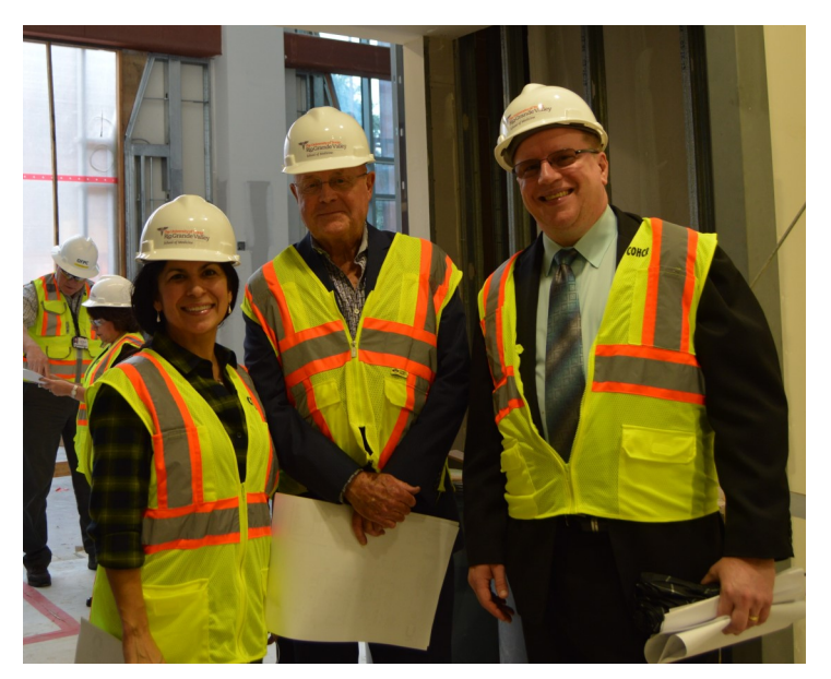
of Medicine. The school is actively working to close the gaps in access to affordable healthcare services while also expanding educational and opportunities for local career residents. The school has opened clinics in rural and underserved areas, which provide the training grounds for students and further insight into the social determinants of health disparities that researchers are examining.