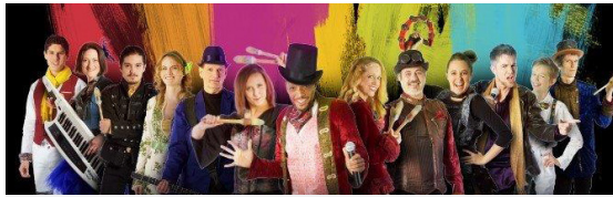
Artrageous The Interactive Art and Music Experience comes to UTRGV!