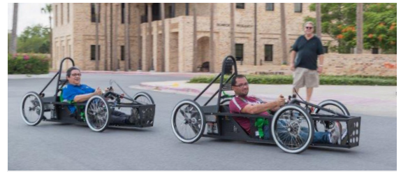
Teachers test drove the cars they built during the information session.