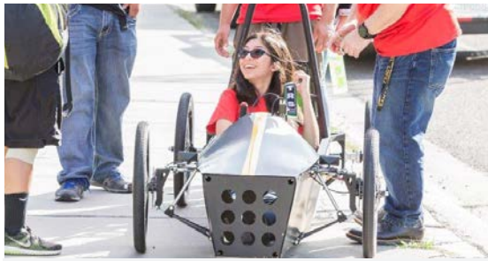
Students from Santa Rosa School District proudly display the electric car they built at the STEM Earth Day Fest.