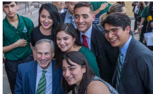
UTRGV student interns with Governor Gregg Abbott at RGV Day in Austin.