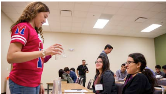
High school students work together during the Latinos On Fast Track (LOFT) Coder Summit at UTRGV.

The Office of Community Relations collaborated with the Hispanic Heritage Foundation and the U.S. Army to host the Latinos On Fast Track (LOFT) Coder Summit on March 30.