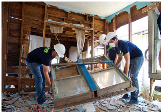
Affordable Homes of South Texas is one of 97 agencies that volunteers will help on Martin Luther King Jr. Day of Service on Jan. 16.

The Annie E. Casey Foundation helps federal agencies, states, counties, cities and neighborhoods to create more innovative, cost-effective responses to the issues that negatively affect children: poverty, unnecessary disconnection from family and communities with limited access to opportunity.