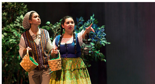
The Office of Public Art together with the College of Fine Arts share the joy of music, dance and theater with concerts and performances year-round like the Bravo Opera Company's production of "Hansel and Gretel".

Fall 2016 also provided unforgettable cultural experiences for children and adults with concerts and performances. Since it opened last fall at the Visitors Center on the Edinburg campus, more than 20,000 students and the public visited the exhibit, A T. Rex Named Sue. The Distinguished Artists Series also featured the acclaimed Ballet San Antonio. There were also workshops, masterclasses, and performances also made possible by the Brown Foundation.