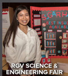
RGV SCIENCE & ENGINEERING FAIR