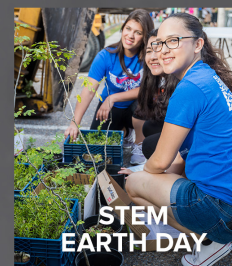
STEM EARTH DAY