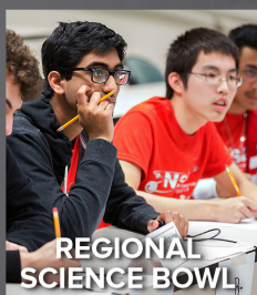
REGIONAL SCIENCE BOWL