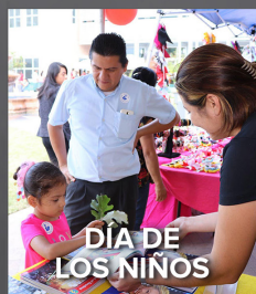
DÍA DE LOS NIÑOS