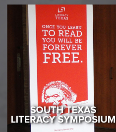
SOUTH TEXAS LITERACY SYMPOSIUM