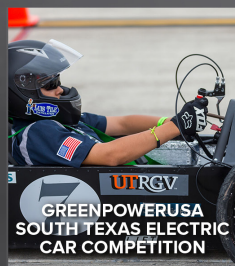
GREENPOWERUSA SOUTH TEXAS ELECTRIC CAR COMPETITION