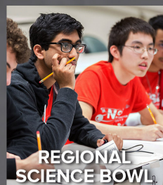
REGIONAL SCIENCE BOWL