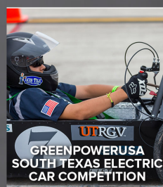
GREENPOWERUSA SOUTH TEXAS ELECTRIC CAR COMPETITION