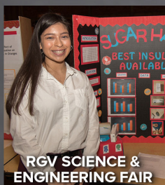
RGV SCIENCE & ENGINEERING FAIR