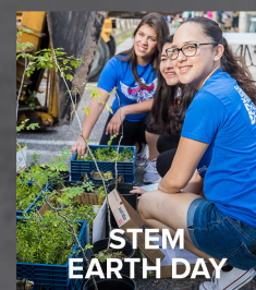
STEM EARTH DAY