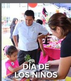
DÍA DE LOS NIÑOS