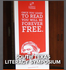
SOUTH TEXAS LITERACY SYMPOSIUM