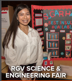
RGV SCIENCE & ENGINEERING FAIR