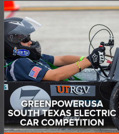
GREENPOWERUSA SOUTH TEXAS ELECTRIC CAR COMPETITION