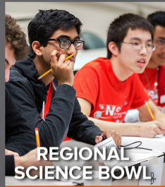
REGIONAL SCIENCE BOWL