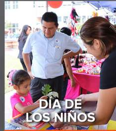
DIA DE LOS NIÑOS