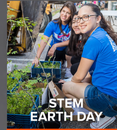
STEM EARTH DAY