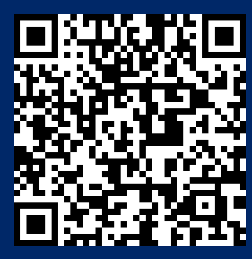
Higher Ed Bill Tracker

O HB1003: allows student IDs as acceptable IDs for voting.