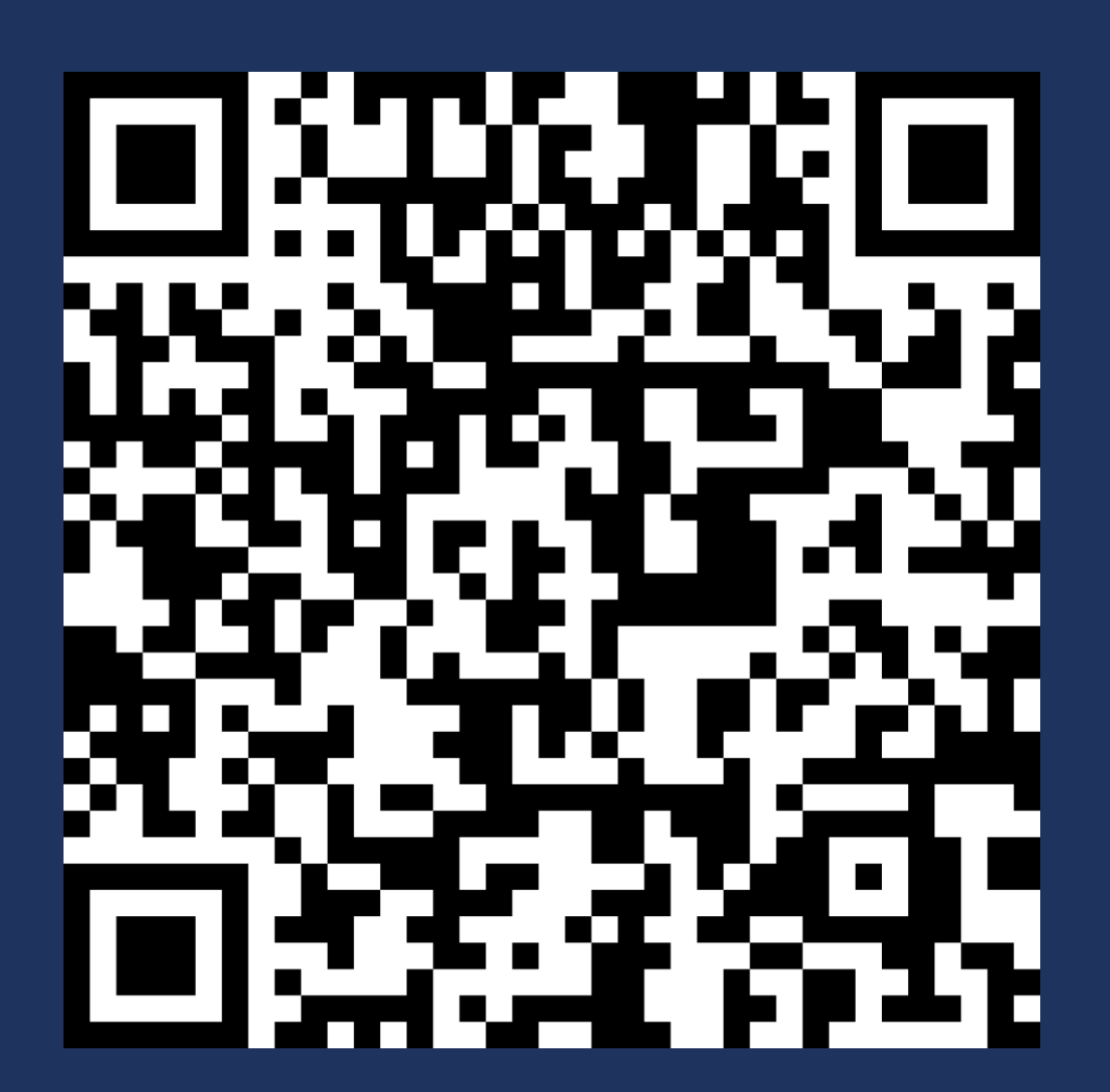
Higher Ed Bill Tracker