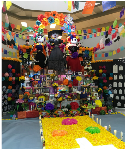
PSJA Memorial Día de los Muertos Altar Competition November 2nd