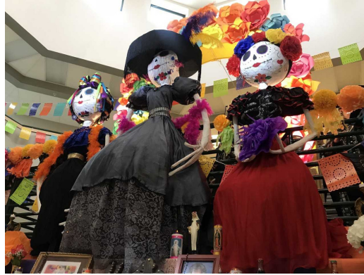
PSJA Memorial Día de los Muertos Altar Competition November 2nd