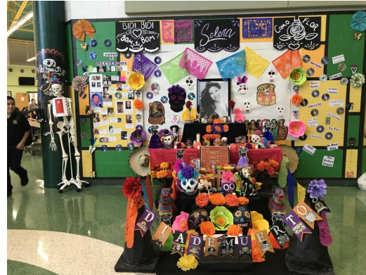
Audie Murphy Middle School Día de los Muertos Altar Competition November 2nd