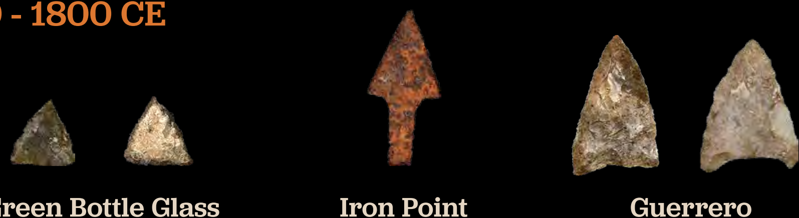
Green Bottle Glass