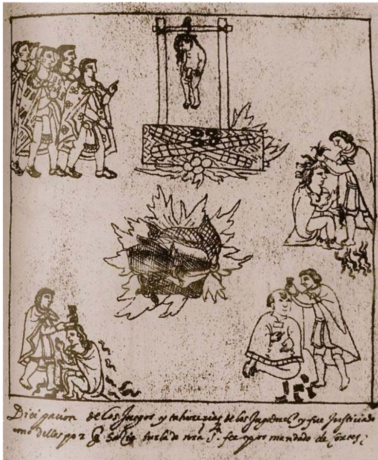
Figure 1: Amerindian functionaries punishing Tlaxcalans who engaged in "pagan" practices.

In another image, the compiler/ artist depicts figures from ten provinces conquered by Cortés. The artist shows each as a standard-bearer and beneath each figure, an indication of the toponym of the province and the written name of each can be identified. Beside seven of the toponyms, a bishop's miter with lappets indicates those that are dioceses, although no European or religious figures are included in this assertion of Amerindian power. This is an interesting configuration reminding the audience that despite the conquest by the Europeans, the subjects are Amerindian and they are "in charge" in a responsible, Christian manner. This reminds us that once most groups were conquered, they did have to participate in the subsequent power structure in some manner. This image shows us that they did claim their roles (at least rhetorically) as leaders in the new order.