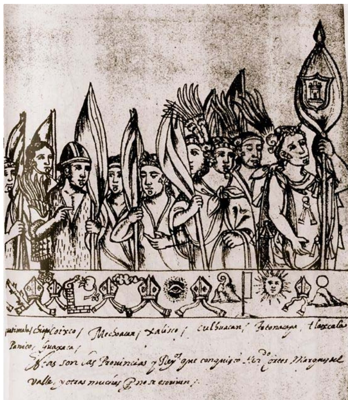
Figure 2: Amerindian Bishoprics of New Spain

Another image illustrates the Tlaxcalan participation in the conquest of Culhuacan in the service of Nuño Beltrán de Guzmán, one of Cortés's most successful and most despised rivals. Interestingly, throughout the 1530's, Cortés and Nuño de Guzmán wield power and engage in fierce political rivalries. The images from the Codex of Tlaxcala offer a neutral record of Tlaxcalan participation throughout Mesoamerica stretching northward into the Zuni Pueblo cultures and southward to the Hibüeras (Honduras). The record narrates Tlaxcalan conquests with Pedro de Alvarado to Guatemala, and with other explorers and conquistadors. The final image in the Codex of Tlaxcala represents the Tlaxcalan version of Marcos de Niza and Vázquez de Coronado's ill-fated visit to Cibola.