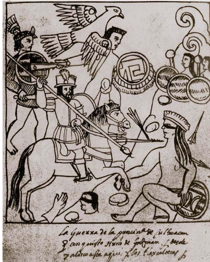
Figure 4: Culhuacanos conquered by Nuño de Guzmán

limited clothing. The Culhuacanos are naked except for loincloths. The lack of clothing is an identifiable mark of a Chichimec group. Another technique often used to identify Chichimecs is their use of bows and arrows as their weapons. While in this defeat we do not see the bows, the arrows flying through the scene support Culhuacano status as Chichimecs. In pre-Hispanic narratives, equilibrium between Chichimec and Toltec qualities was celebrated. In the discussion of Cíbola, we find that the concept of Chichimec has taken on a new dimension.