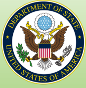
Department of State & USAID