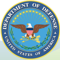
Department of Defense

Thousands of Boren Awards alumni have started careers in these priority agencies: